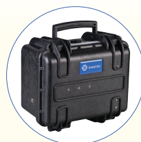
SB270_EB External Battery to Monitoring Station 33Ah