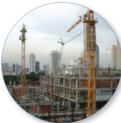
Noise Emission Monitoring