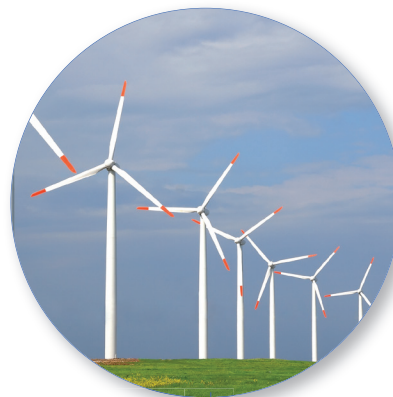
Wind-farms Noise Monitoring