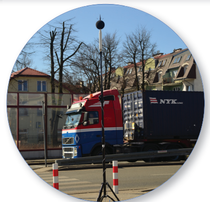
Community Noise Monitoring