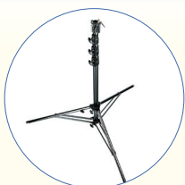
SA206 Mast for Microphone Protection Kit